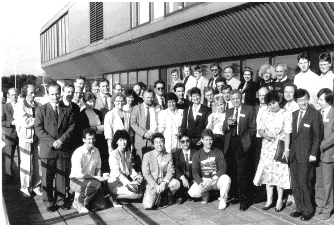
ISSA Tallin 1991

Are you in this photograph? Who else do you recognise? Please tell us!!