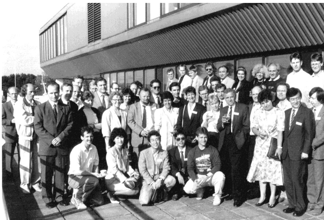
ISSA Tallin 1991

Are you in this photograph? Who else do you recognise? Please tell us!!